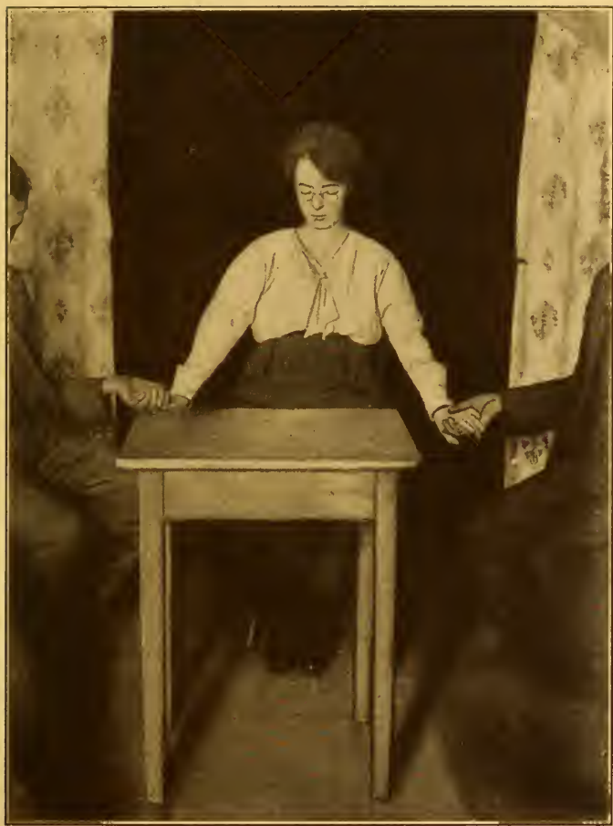
1 FIG. 1 2